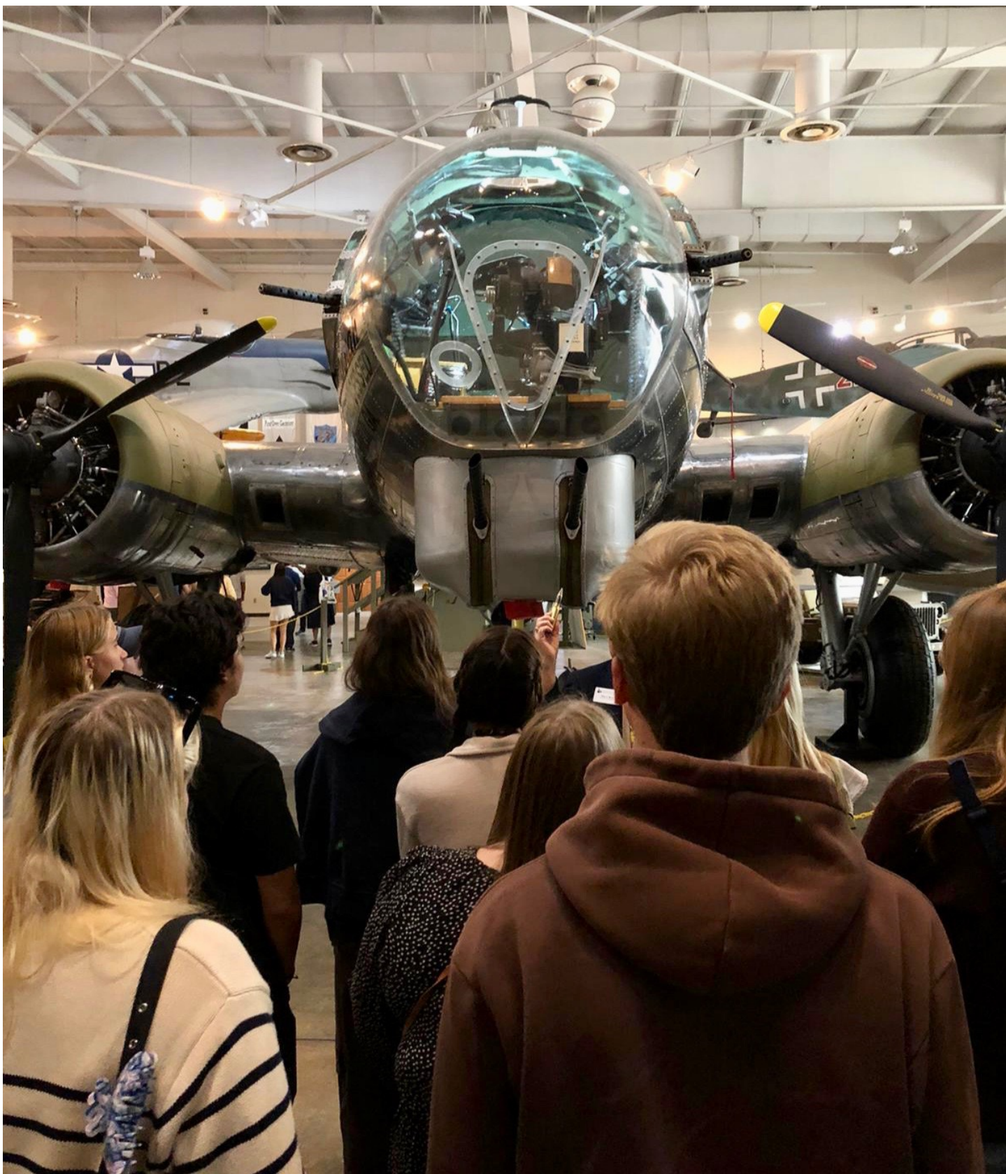
Posted by Katheryne Fields October 30, 2023