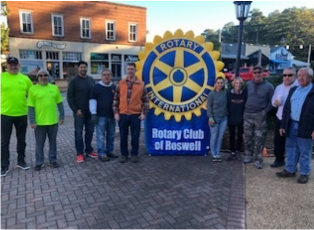
Posted by Trummie Patrick November 1, 2020