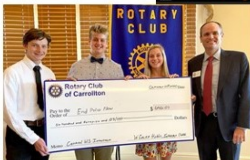
Above: Carrollton Rotary extends Many, many thanks to the Central High School Interact Club for its donation to our End Polio Now campaign!