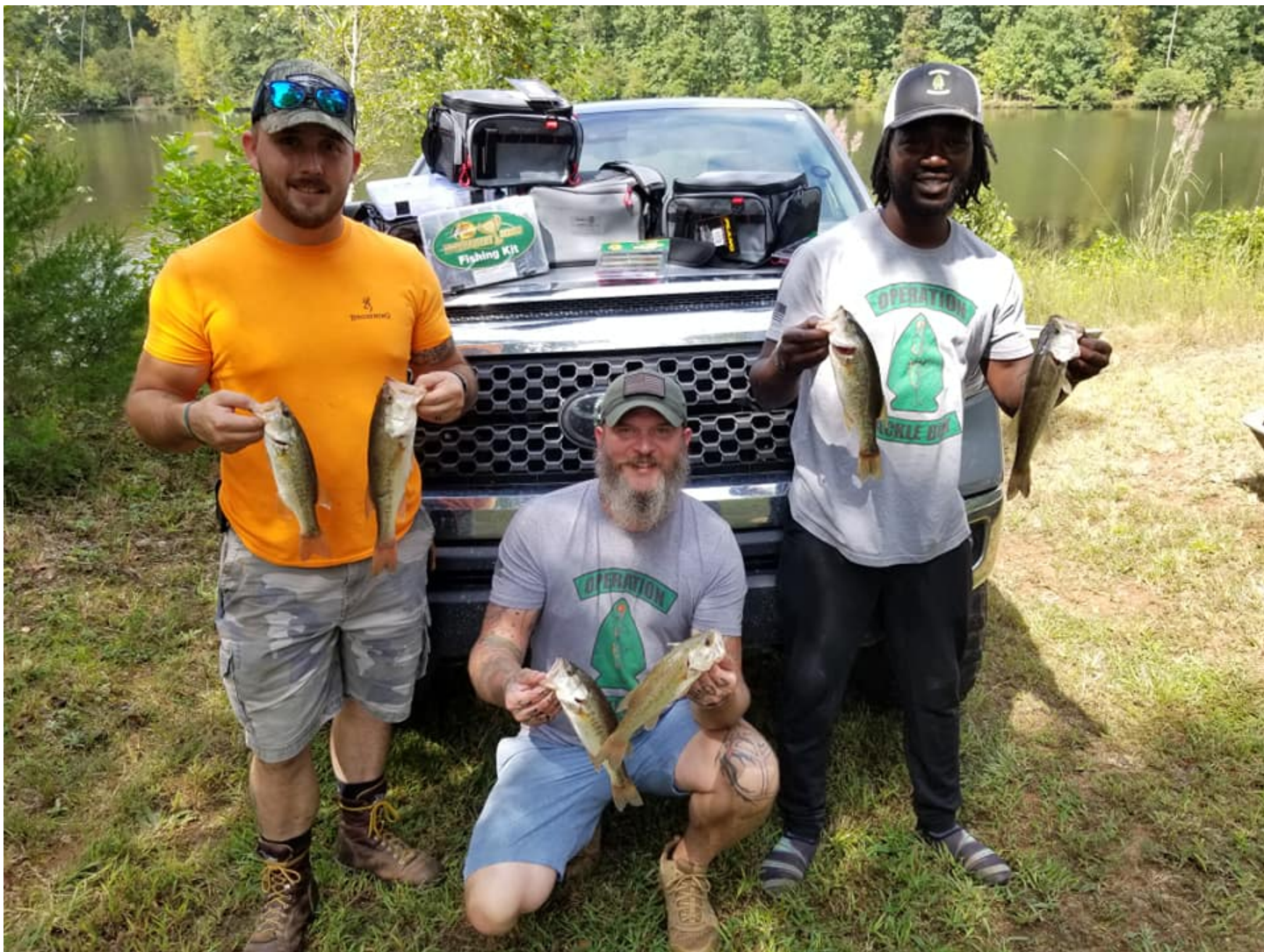
Posted by Jackie Cuthbert November 6, 2020