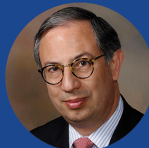
Carlos del Rio