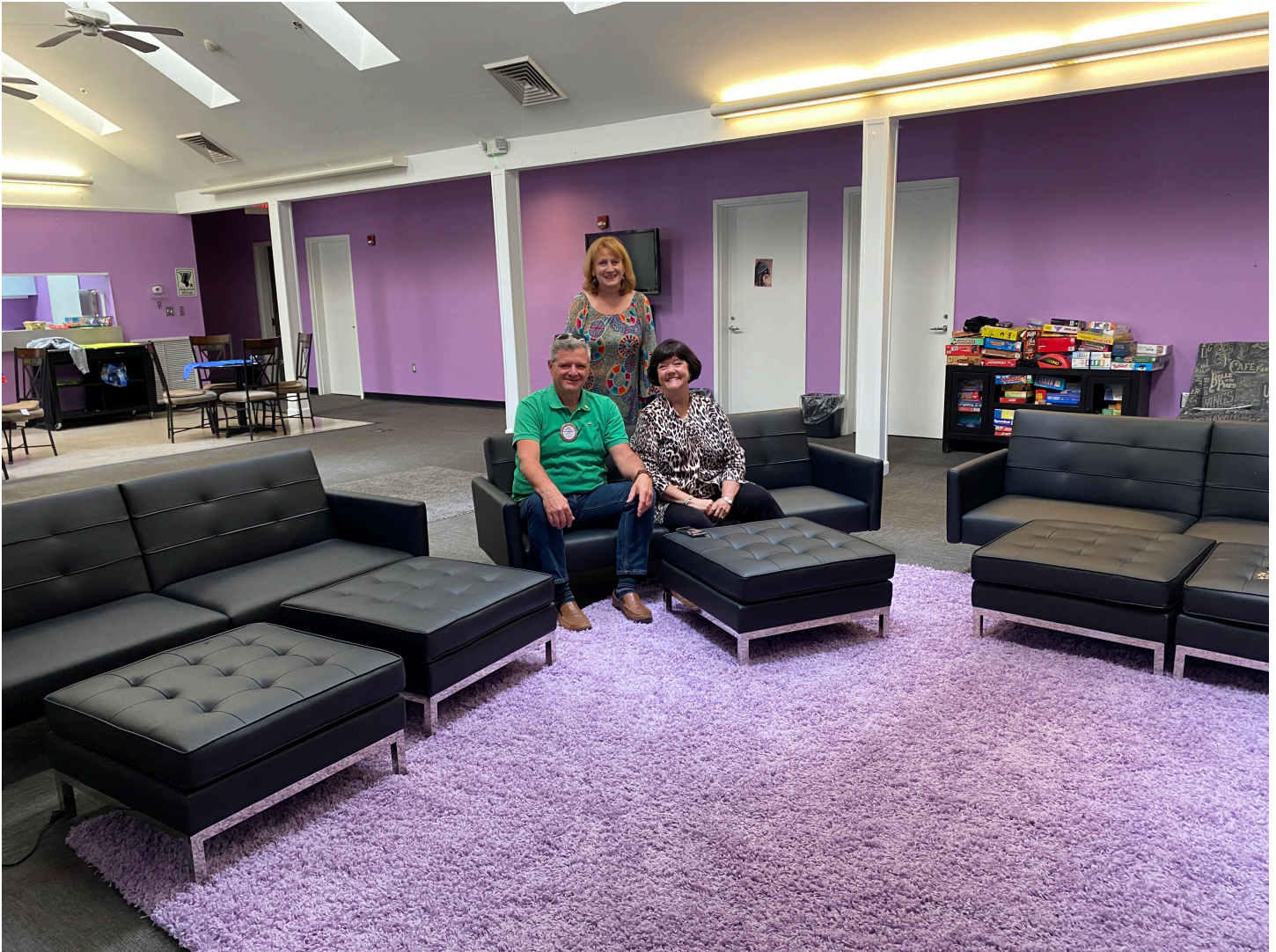
Posted by Rene Lanier June 2, 2022