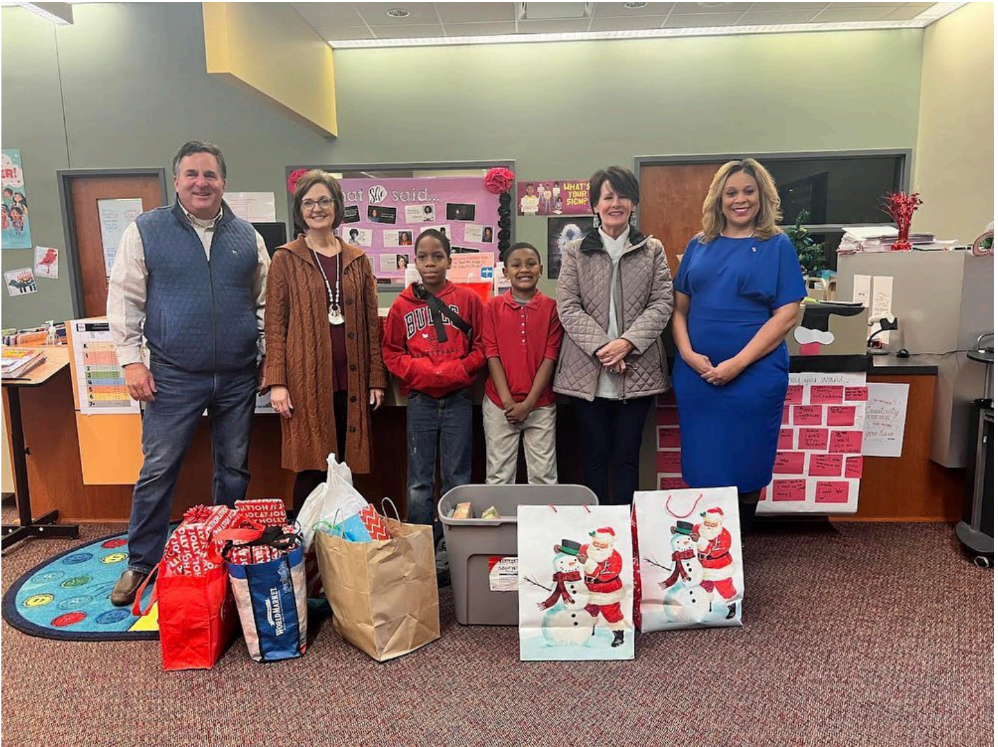
The Rotary Club of North Columbus was glad to be a part of Adopt a Family at Rigdon Road School! As Rotarians, we love any opportunity to get involved & give back to our community. Vinings Cumberland Rotarians dropped off 50 gifts for the young children at La Amistad for the after-school participants; many are ESL kids and some of club members volunteer to tutor them. The Rotary Club of Quitman spent a chilly but worthwhile morning picking up litter on the club's adopted two-mile stretch of SH37 north of Quitman. Eighteen big bags were collected. "Don't Mess with Texas!"