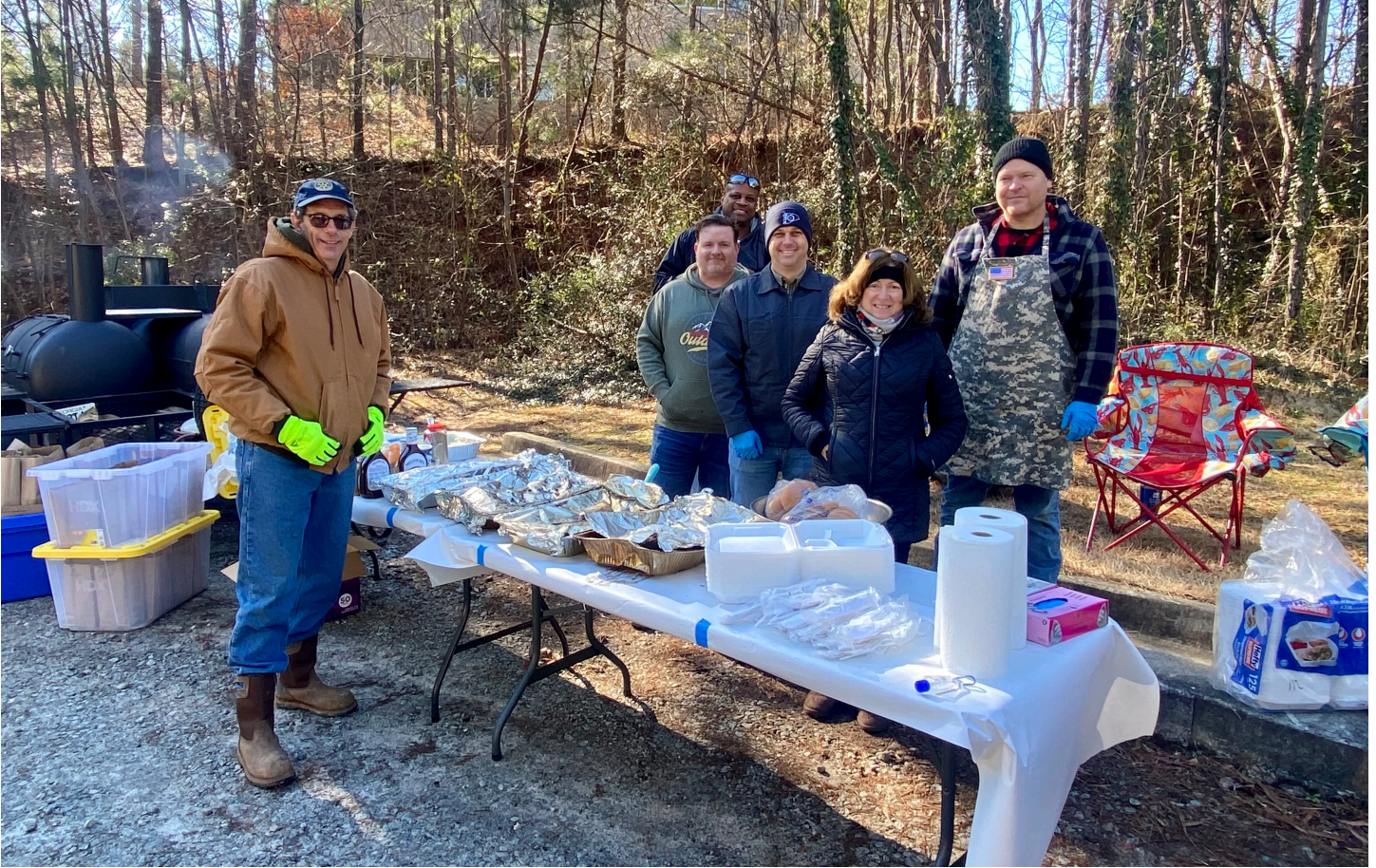
Posted by Nell Boggs March 27, 2023