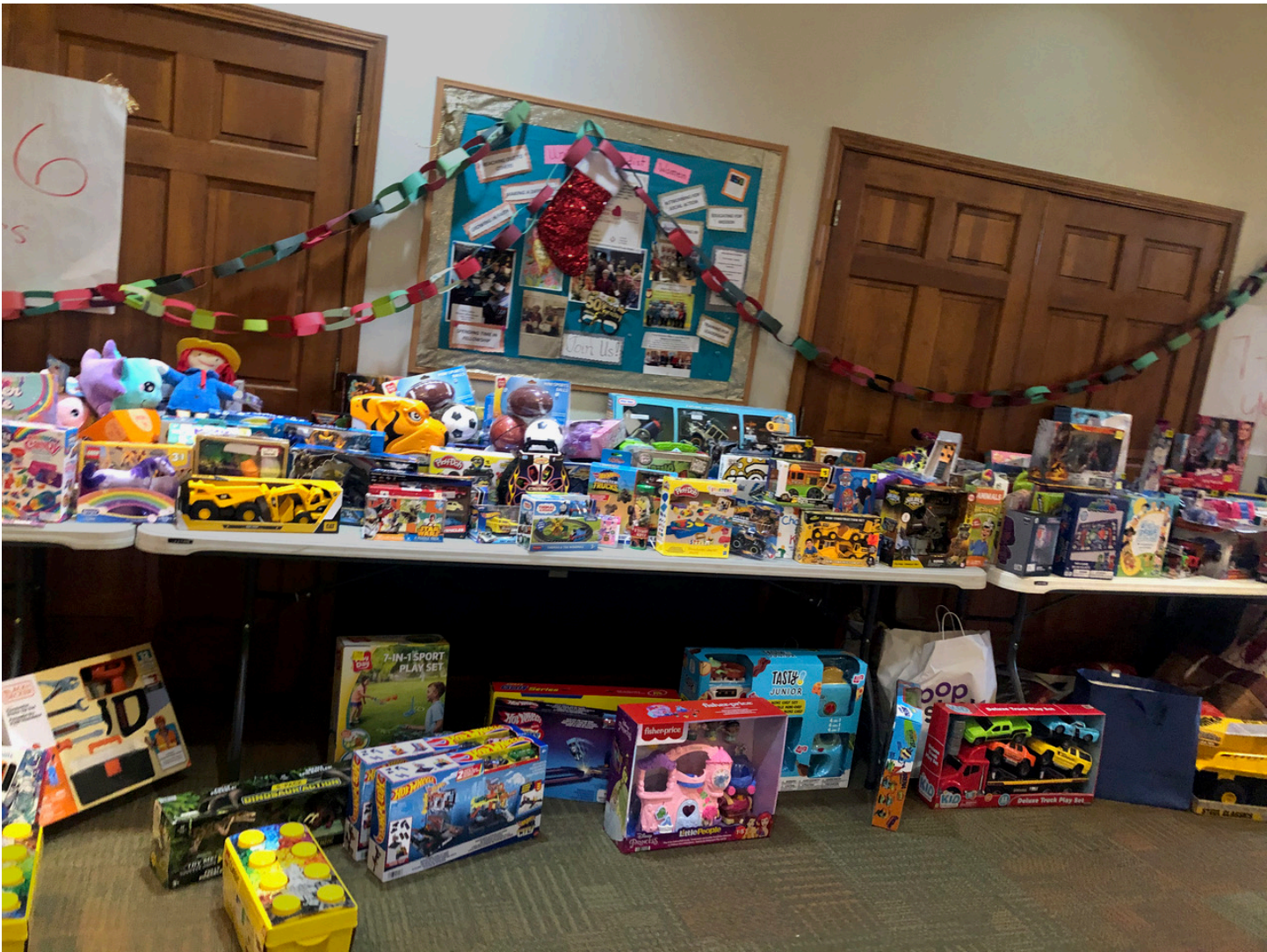
Posted by Pat Keating January 9, 2024