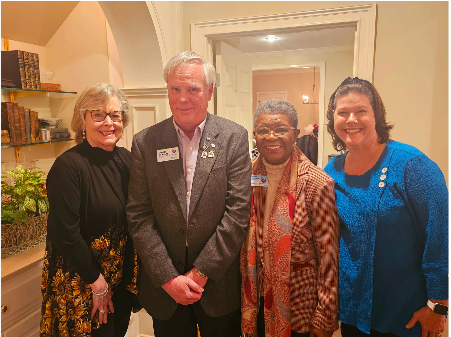
Posted by B. HODGES-TILLER Hodges-Tiller January 9, 2024