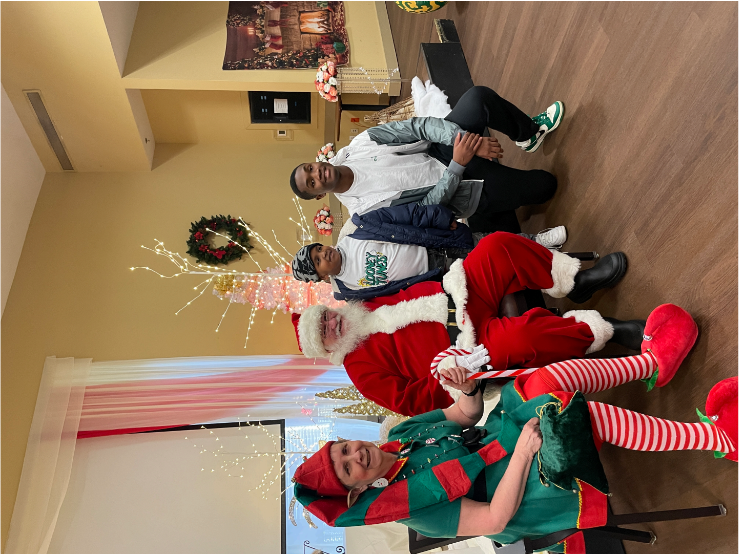
Posted by Claudia Mertl January 9, 2024