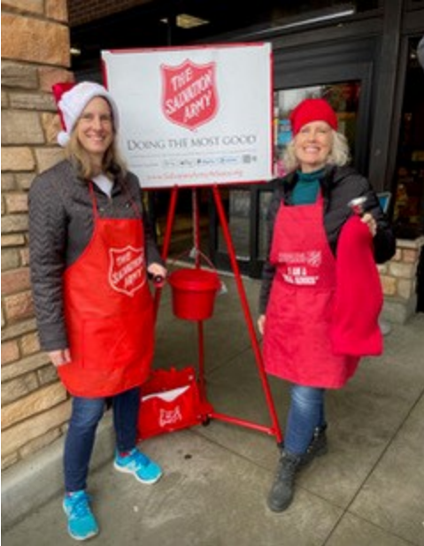
Posted by Jackie Cuthbert January 9, 2024