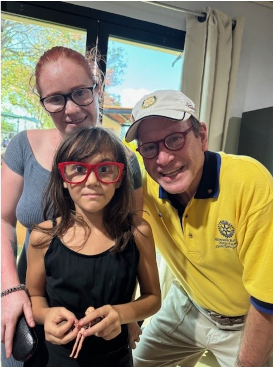
Posted by Kathryn Igou March 30, 2025