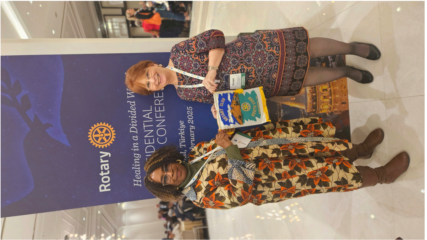
Posted by Ada Wikina April 2, 2025