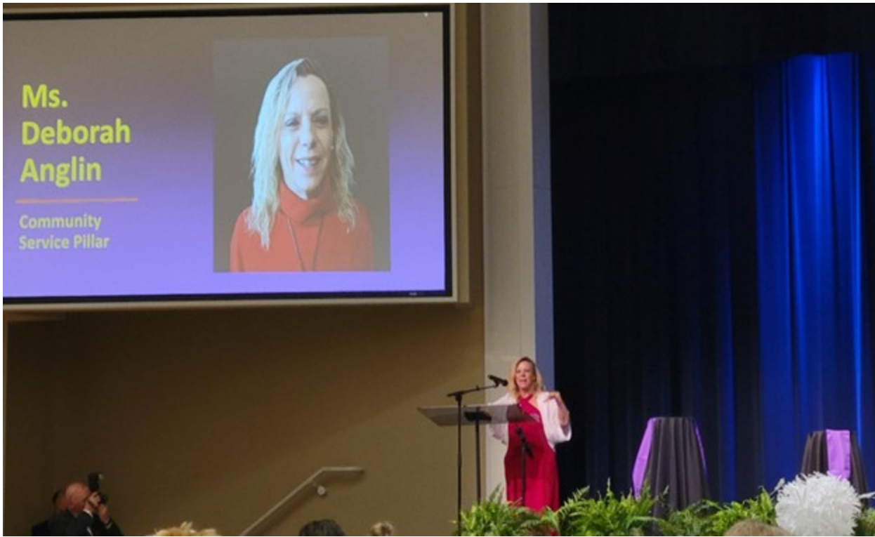
Posted by Judith Bennett March 30, 2025