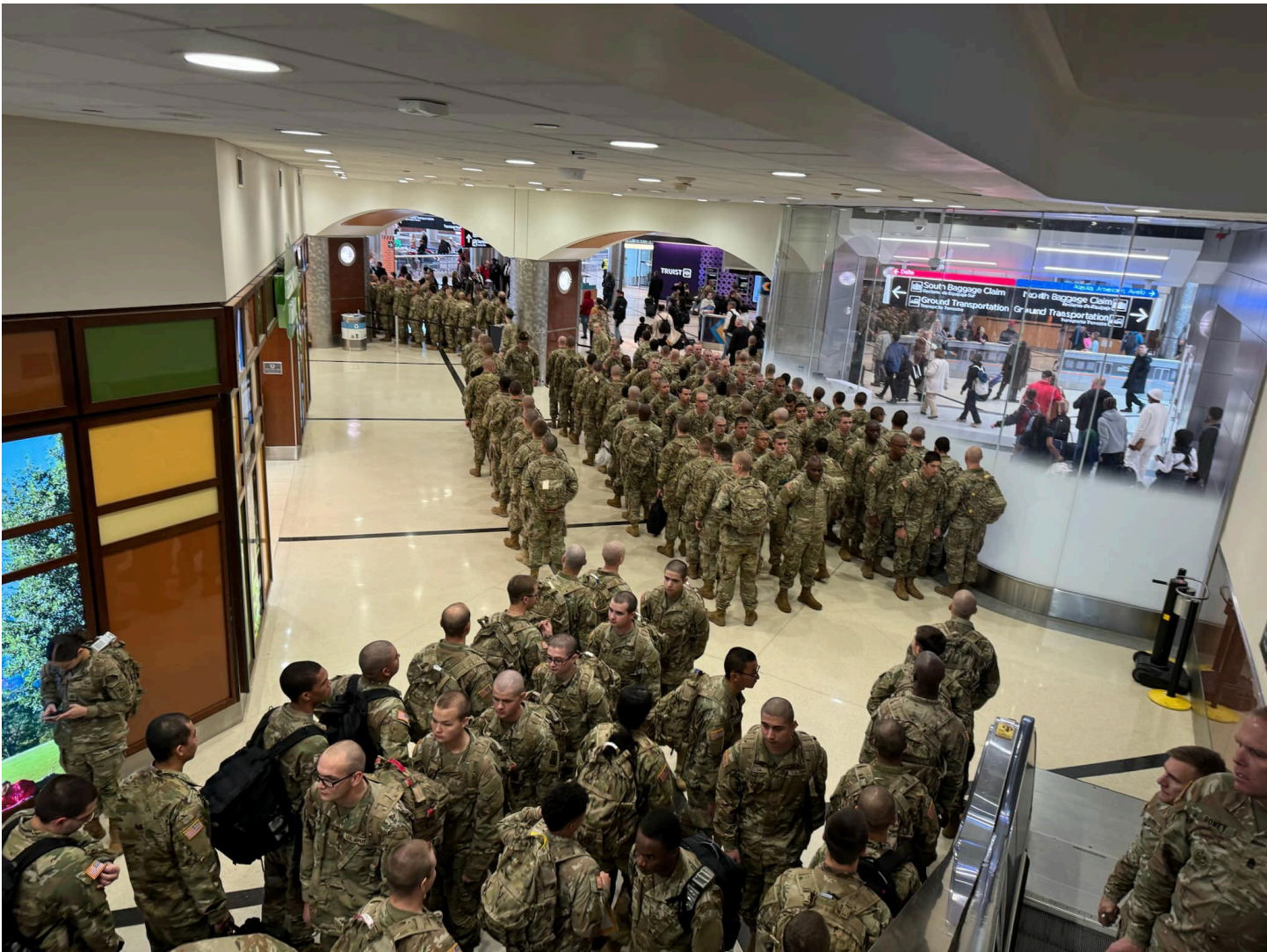
Posted by Roy Strickland April 2, 2025