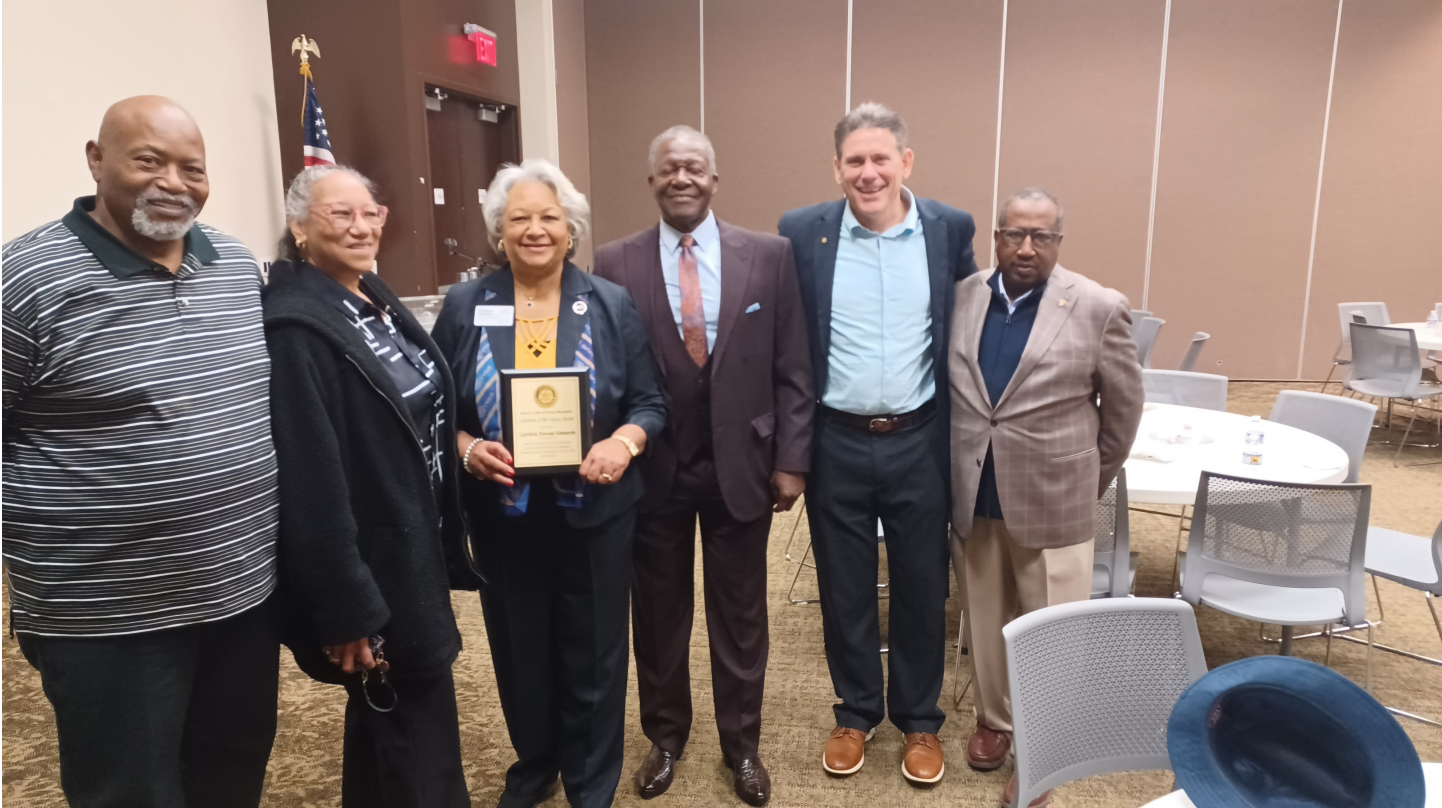
Posted by Darlene Daly April 2, 2025