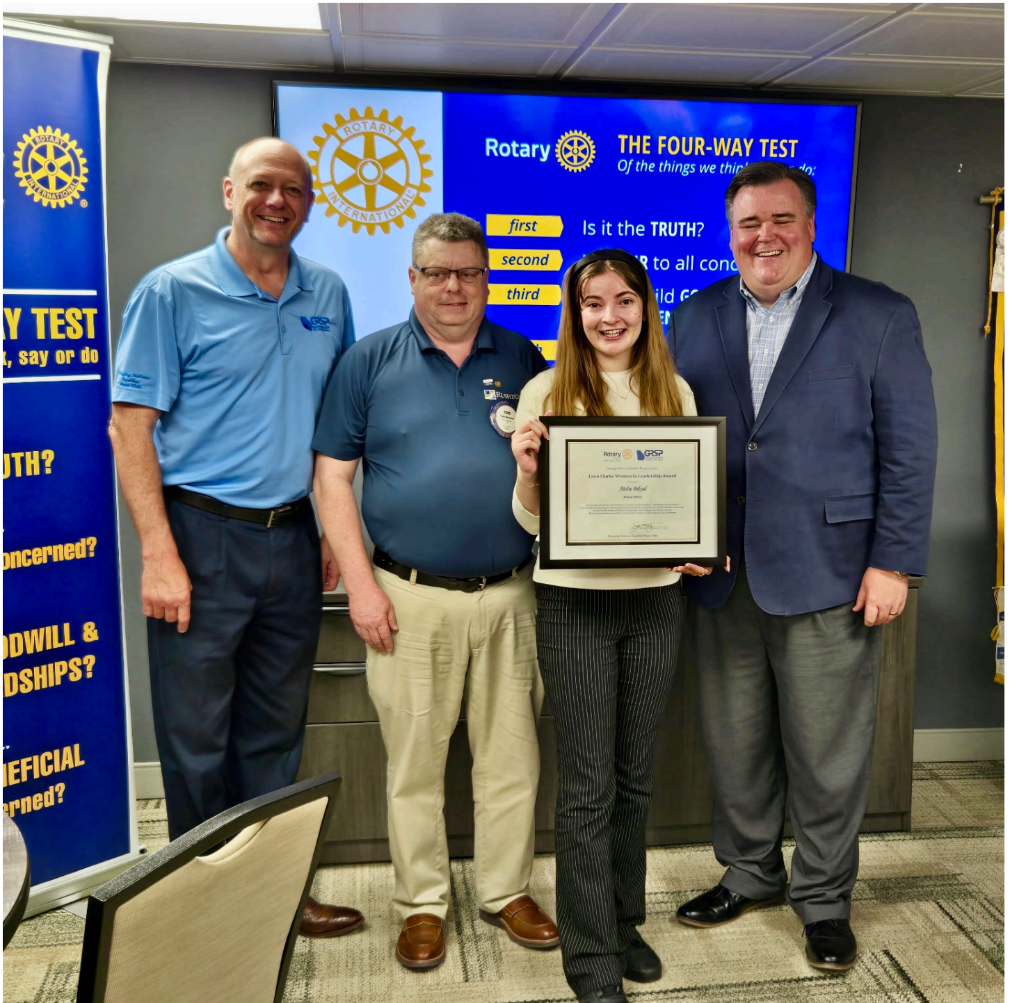
Posted by Kathyrynne Fields May 3, 2025