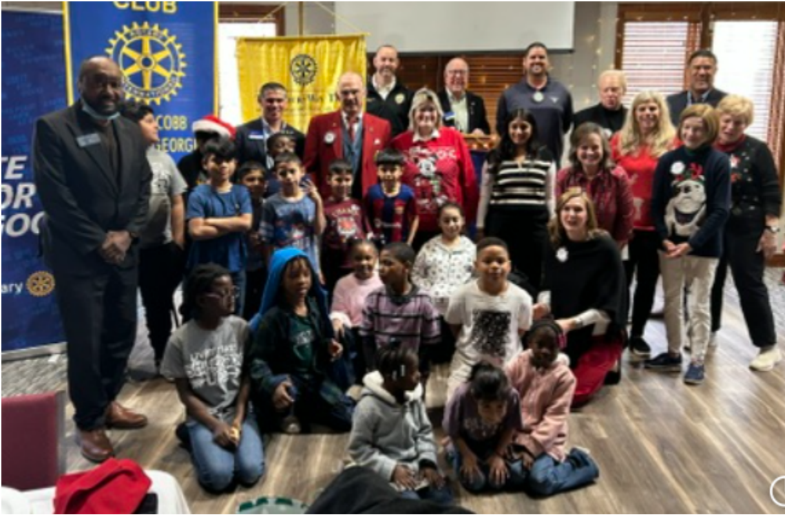
South Cobb Rotary Christmas

Happy New Year! We are now at the halfway point in the Rotary Year. I hope everyone had a safe and happy holiday season and had a chance to spend quality time with friends and family. I know some of you saw the holiday video message on our district web site. I think the holiday season is a great time to recharge and reflect on what you plan to accomplish in the upcoming year. Along those lines, I hope you all are as excited about the second half of the year as you are the first and that we all plan to complete 25-26 strong.