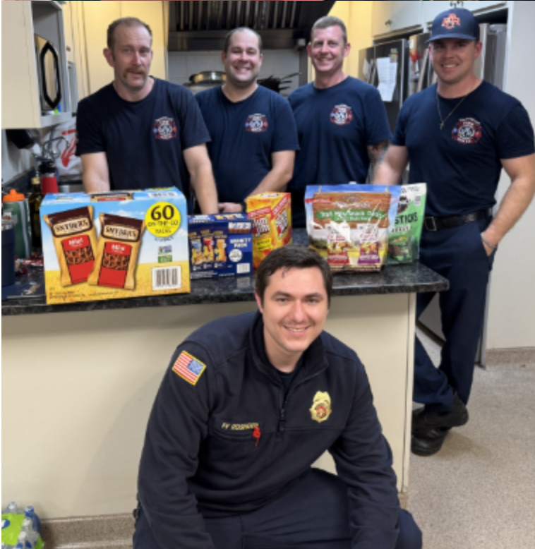
Posted by Steve Ivory December 30, 2025