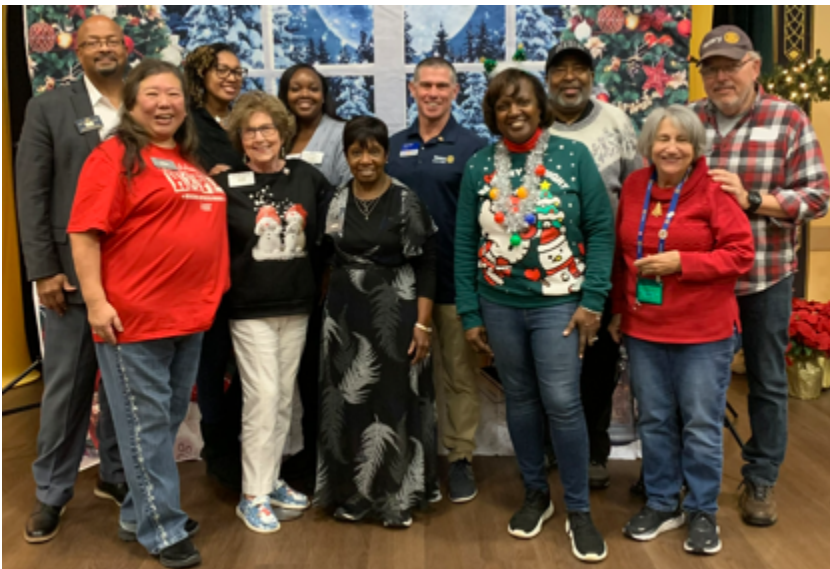
Atlanta Southern Crescent Rotary Christmas