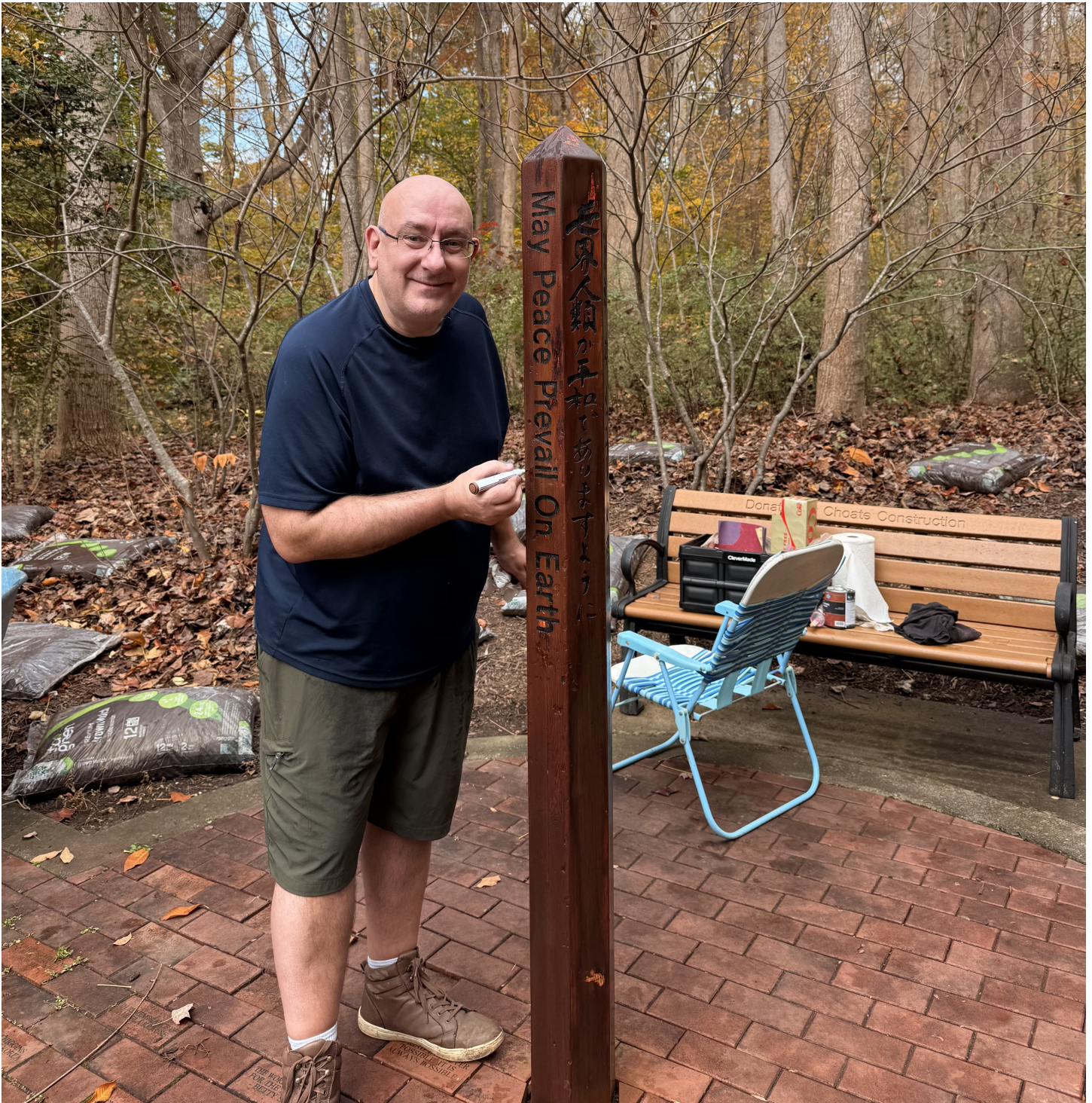
Posted by Lisa Gelber December 22, 2025