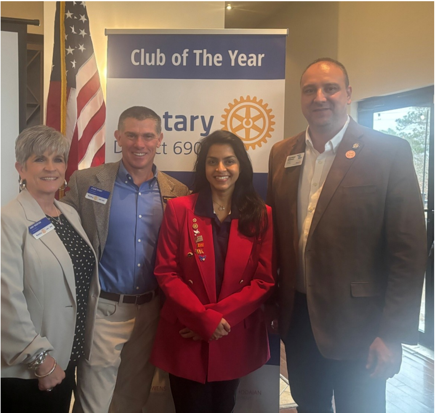
DG Steve with our visiting Peace Scholar at Peachtree City Rotary