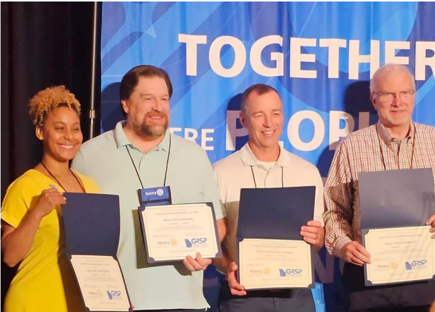
Posted by Katheryne Fields April 29, 2026