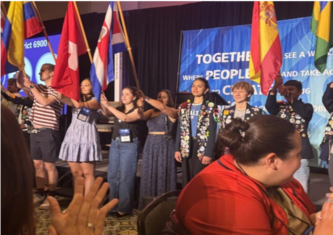
GRSP carries on tradition of presenting their flags

This May, as Rotary celebrates Youth Service Month , District 6900 proudly shines a light on the students, young professionals, and emerging leaders whose lives are being shaped through Rotary. From Interact and Rotaract to GRSP, RYLA, Laws of Life, scholarships, and mentoring, we are not just serving youth — we are investing in the future of our communities and our world. The photos are from District Conference, where many of you saw an amazing show on Saturday morning showcasing our GRSP, RYE, Laws of Life, RYLA programs. GRSP students acted as golf cart drivers and many great interactions occurred. Remember that RYLA starts June 6 so please sign up your students - there's an article later in this newsletter about this.