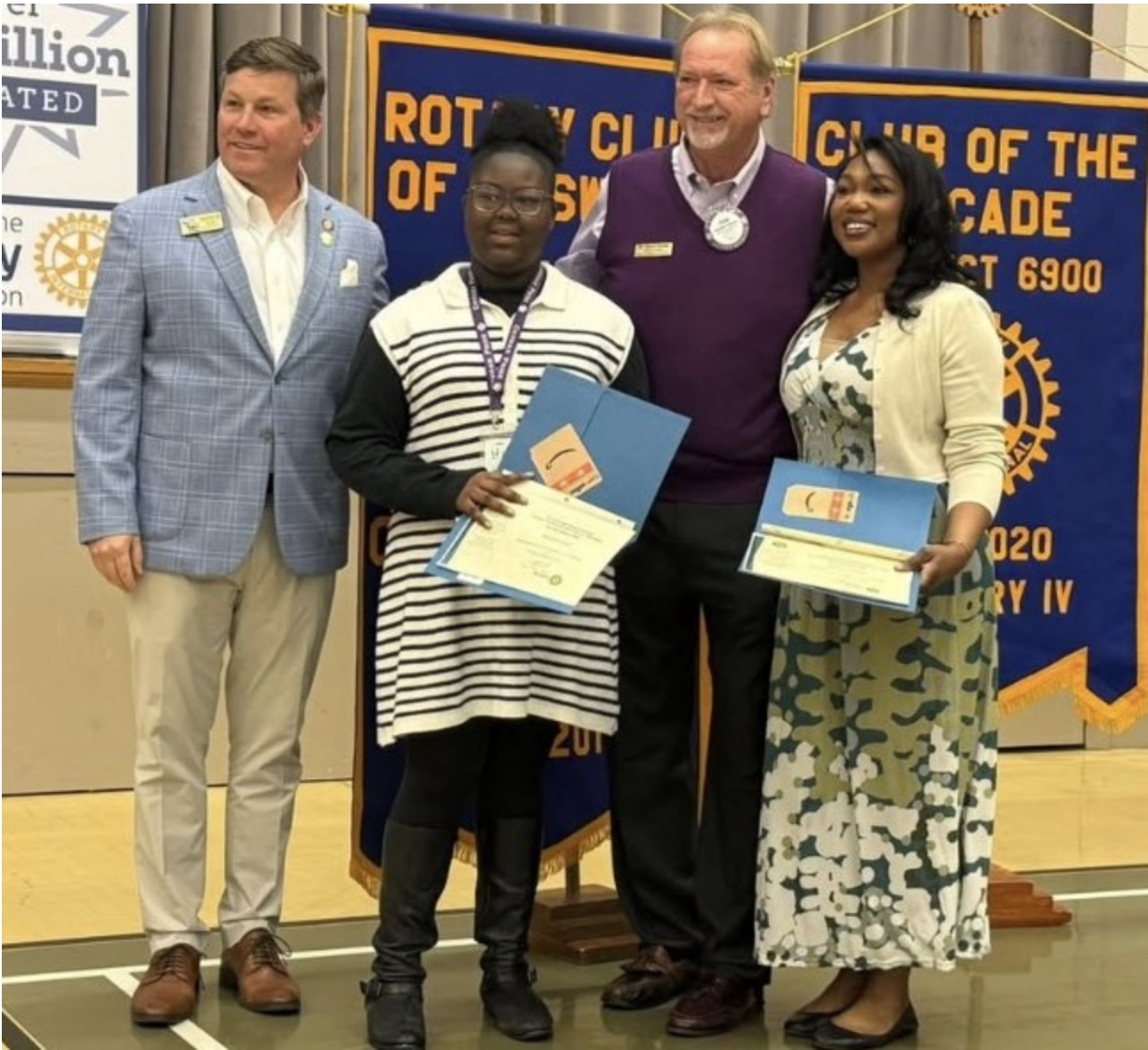
Posted by Becky Nelson April 29, 2026