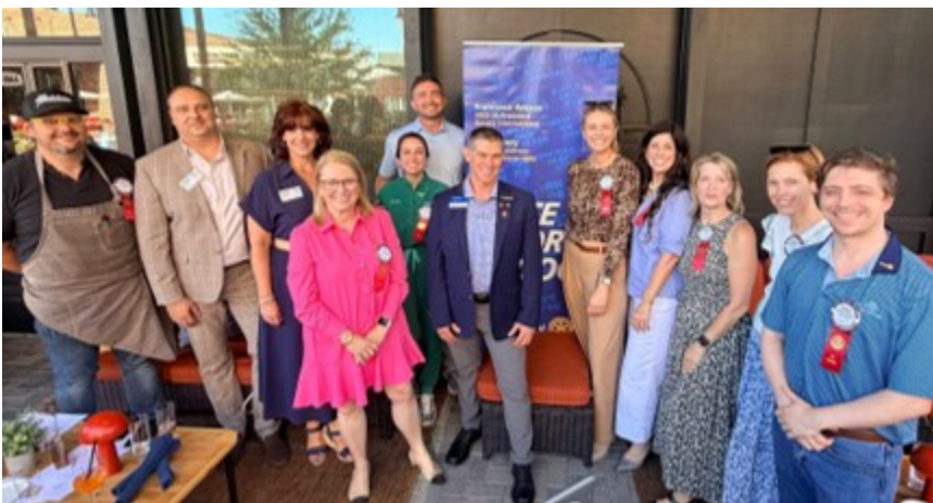
Trilith Companion Club