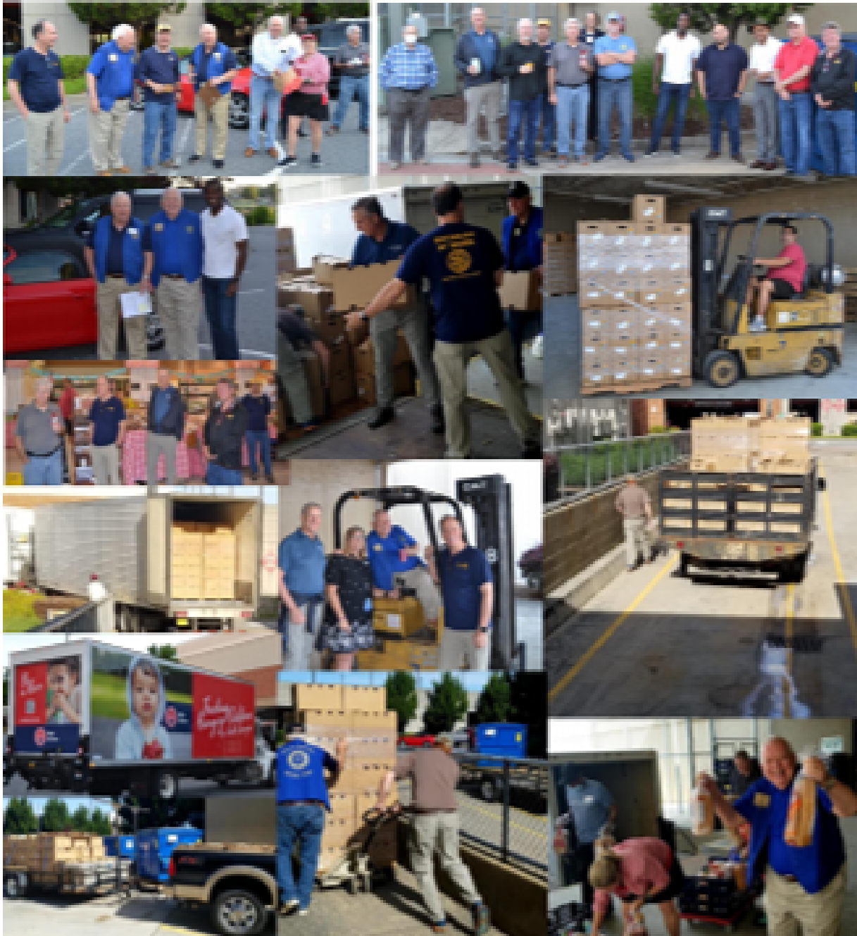
USDA FOOD BOXES PICK UP & DISTRIBUTION AT SOLIDARITY SANDY SPRINGS MAY 20, 2021