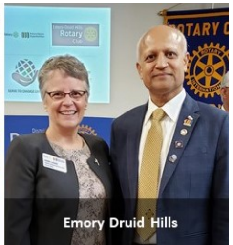
Emory Druid Hills