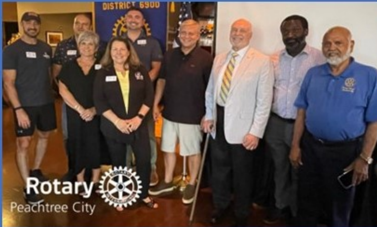
Rotary Peachtree City