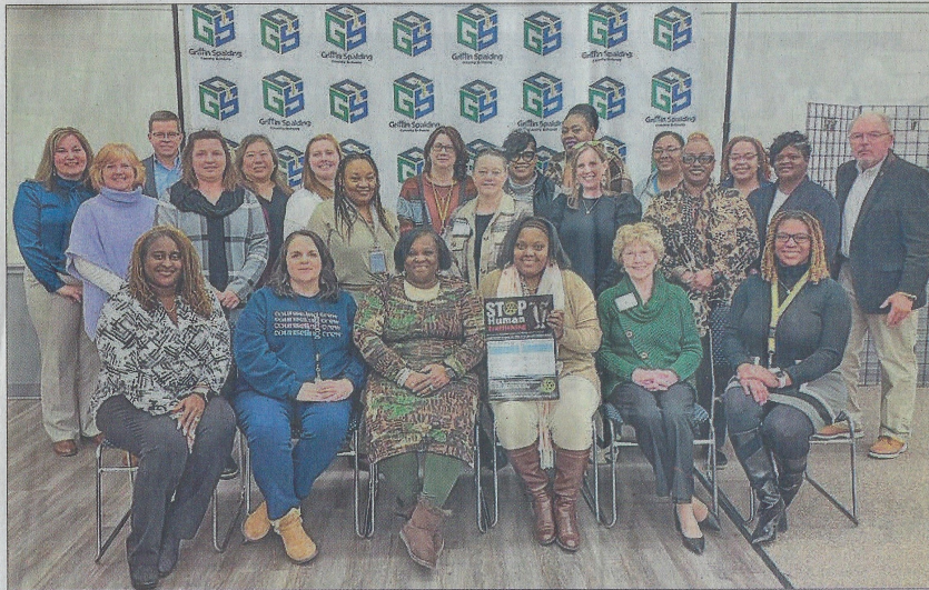
Griffin Daybreak Rotary members along with members of the Rotary Clubs of Atlanta Southern Crescent and Henry County met with Griffin-Spalding School System counselors, social workers and central office employees to raise awareness of the problem of human trafficking in the community. All GSCS middle and high schools were provided with human trafficking resources.

Rotary members discuss human trafficking with GSCS staff