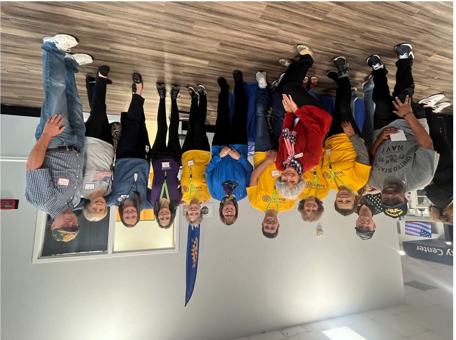
Posted by Nancy Prochaska November 29, 2023