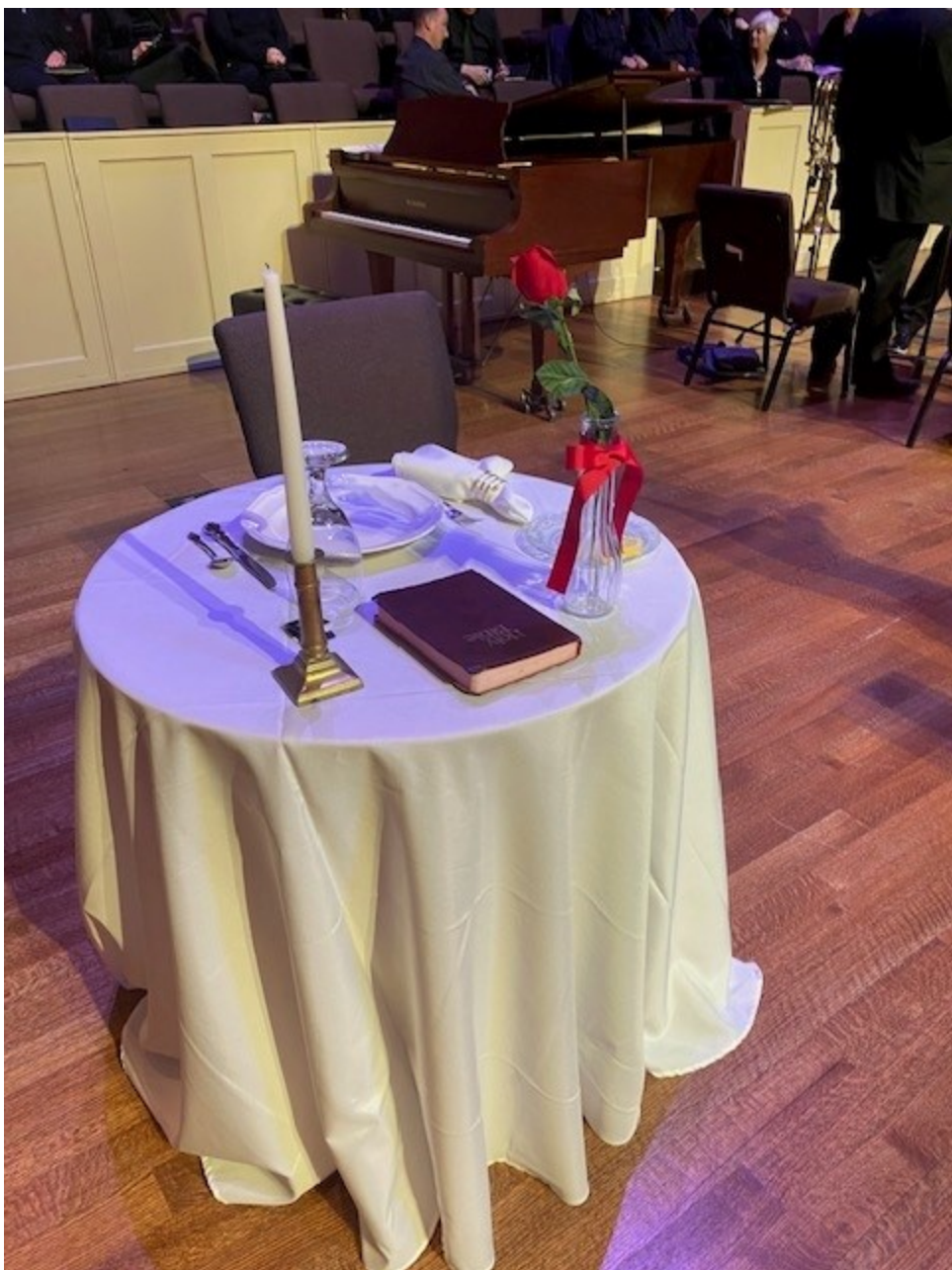
Posted by Rene Lanier November 29, 2023