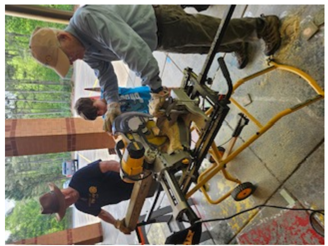
Posted by Sally Platt May 5, 2024