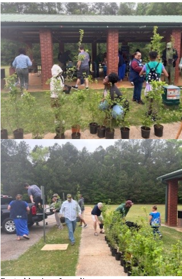
Posted by Amy Lemelin May 5, 2024