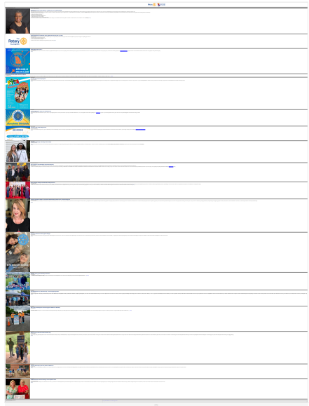
May 17, 2024