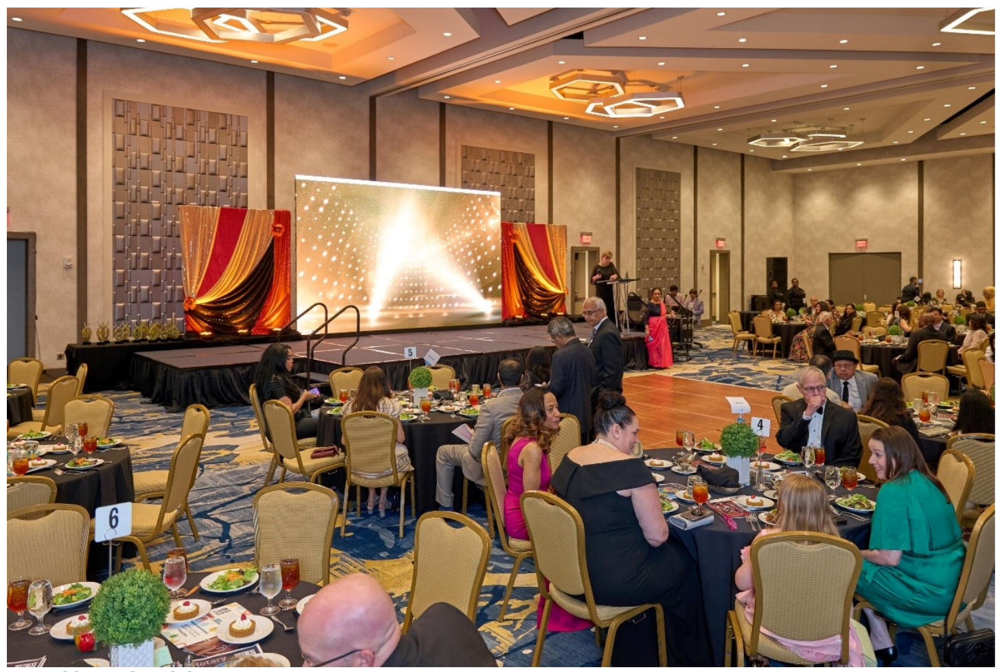
Posted by Syd Padala May 5, 2024