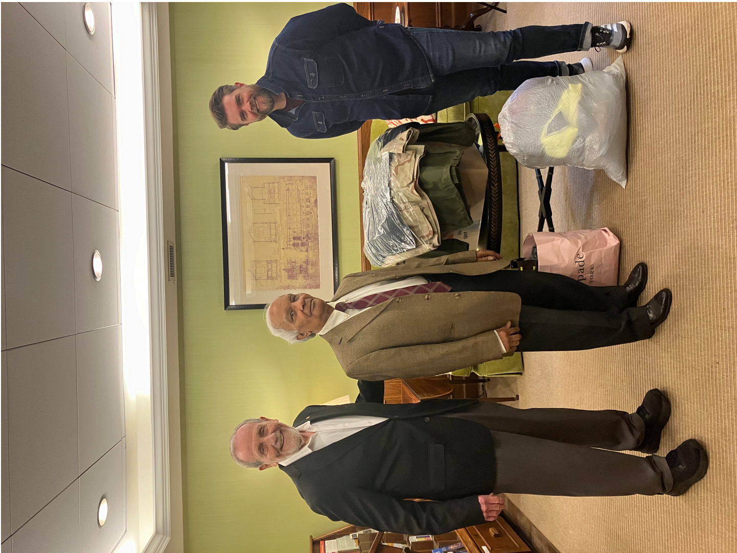
Posted by Angeli Abrol Duggal January 3, 2025