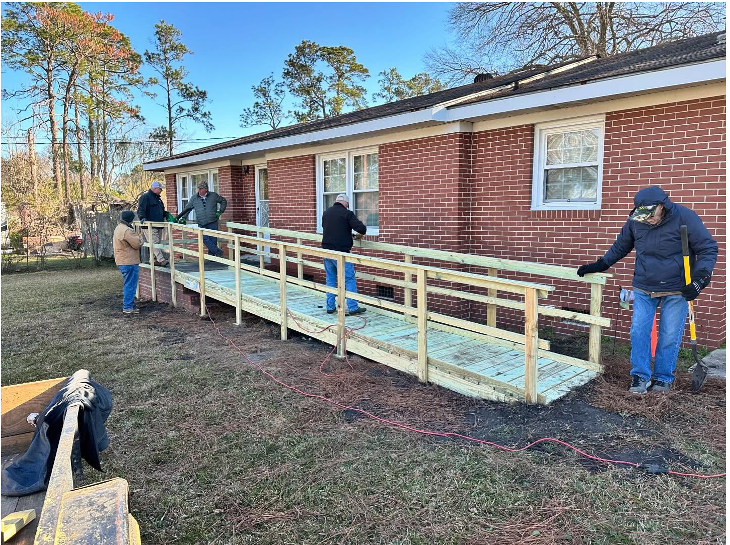
Posted by Ralph Taylor, III March 2, 2025