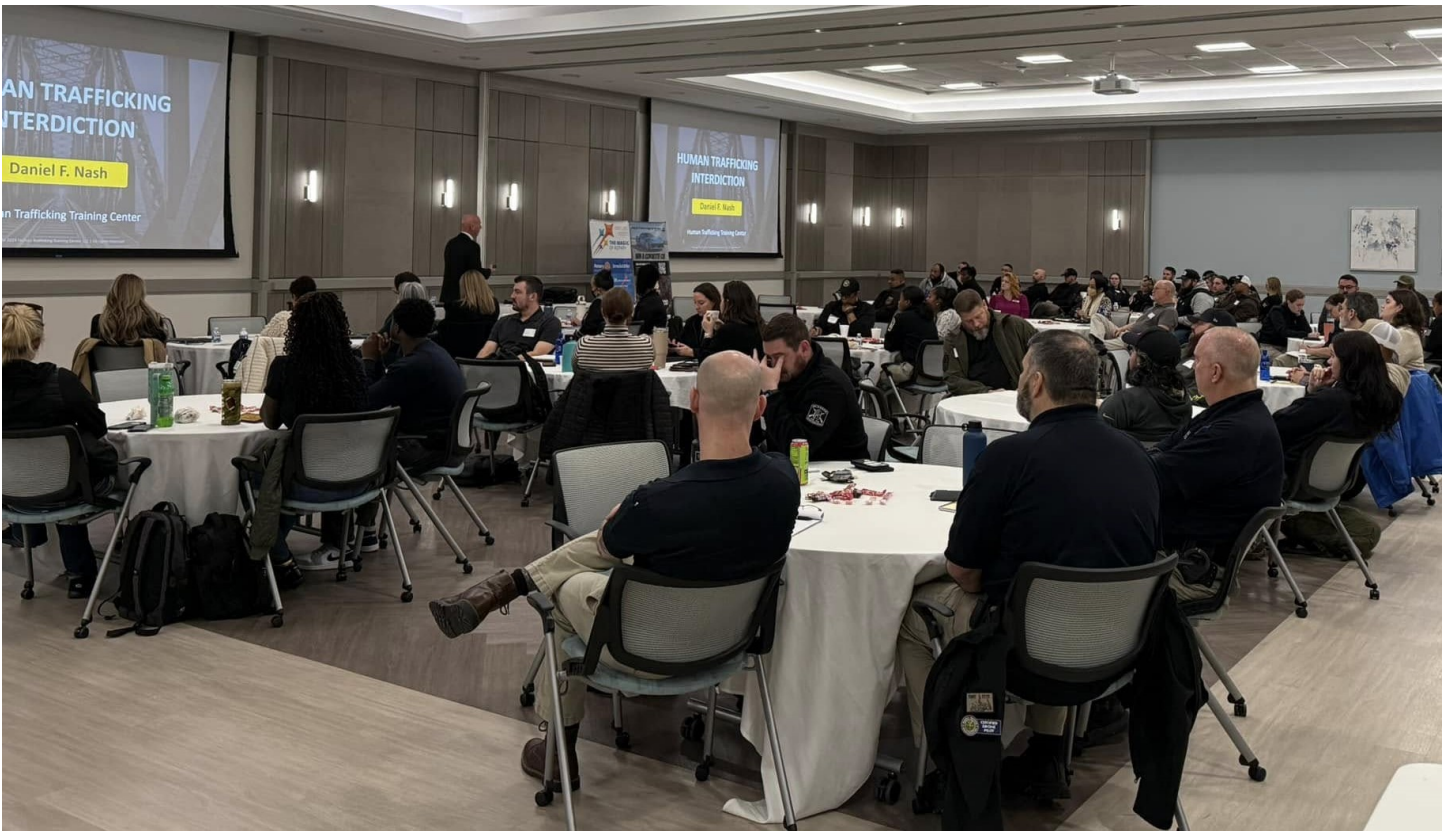
Posted by Mandy Timmons March 2, 2025