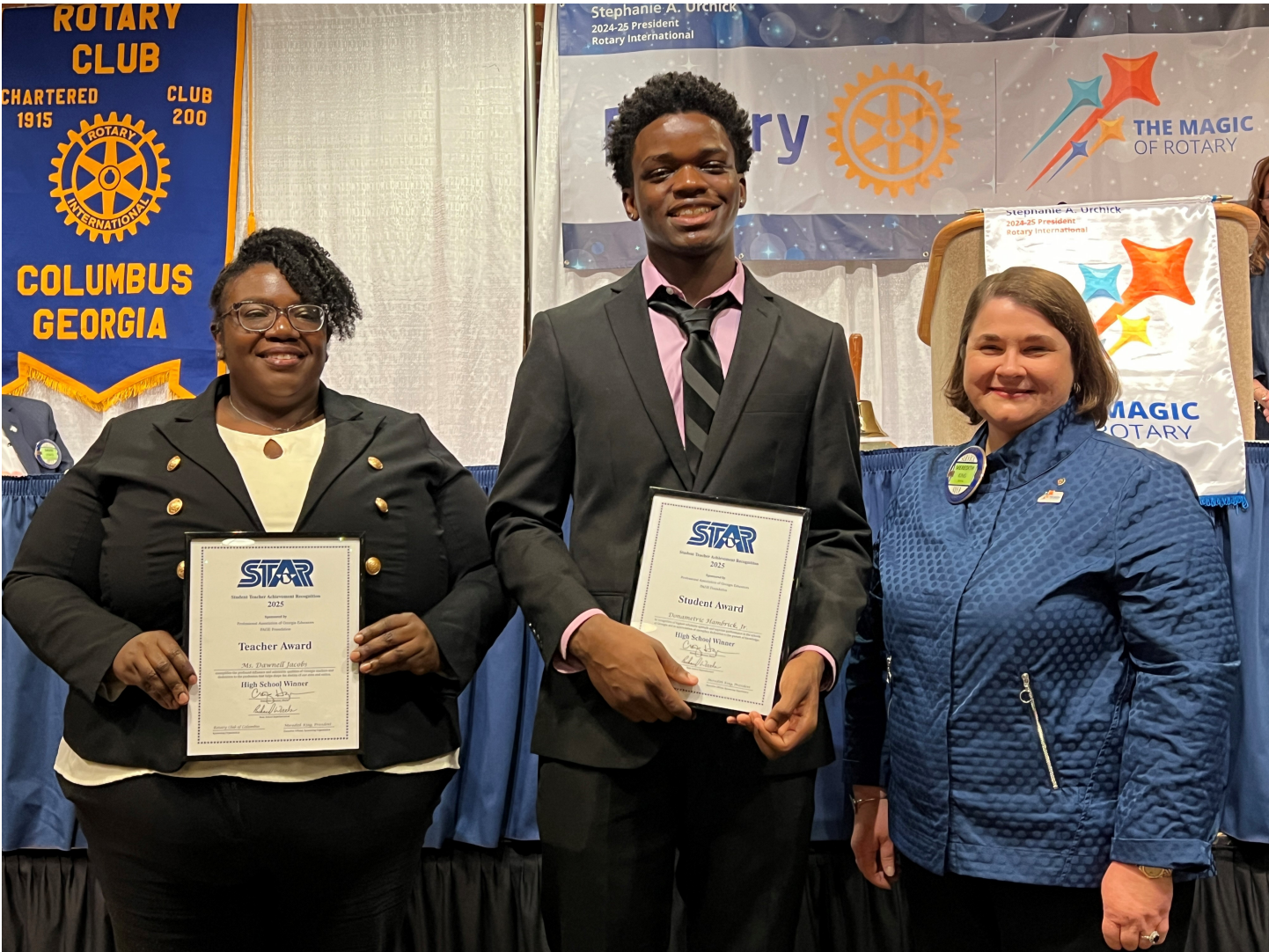
Posted by LeighAnn DiCesaris March 2, 2025