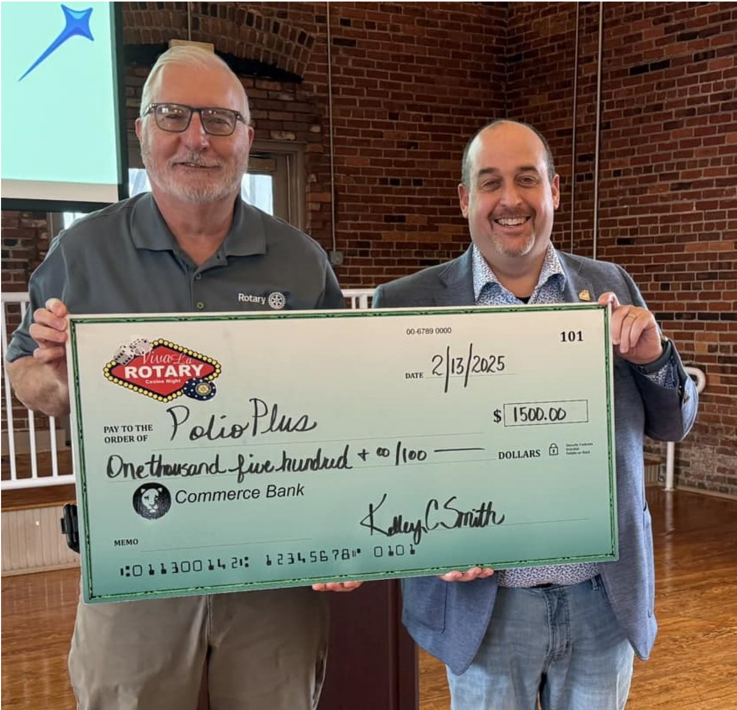
The Camilla Rotary Club recently donated $1,500 to the End Polio Now campaign. With the Gates Foundation 2 to 1 match, this donation will provide 7,500 doses of polio vaccine. And that's not all - last Saturday night, the club hosted a Casino night, with proceeds to support the Mitchell-Baker Service Center, a day program that serves over 95 adults with developmental disabilities.