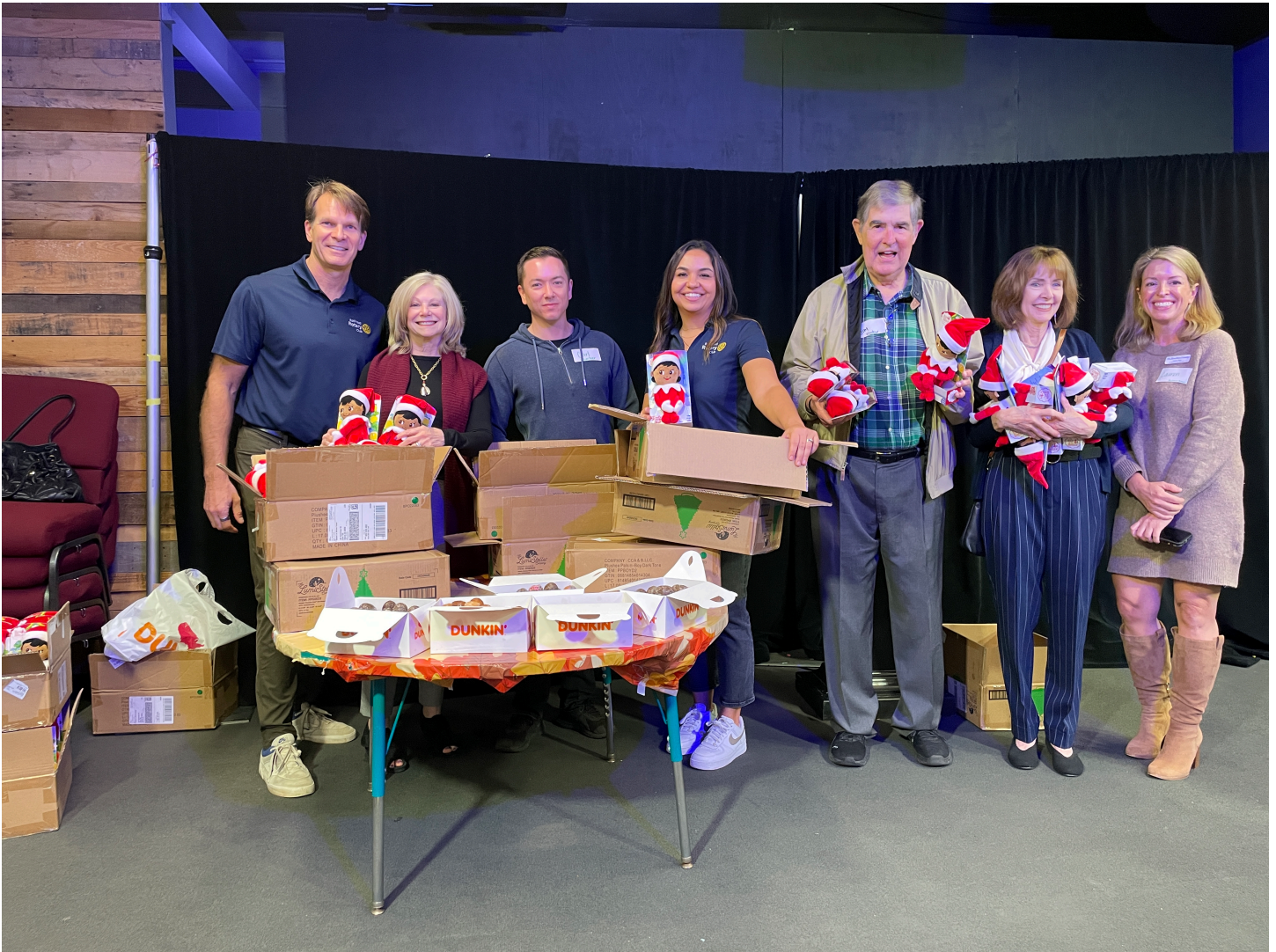
Posted by Shelley Hammell November 21, 2025