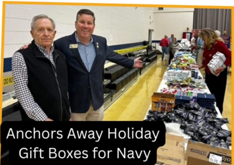
Anchors Away Holiday Gift Boxes for Navy