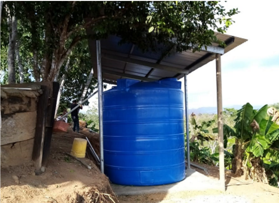
Posted by Trummie Patrick June 3, 2021