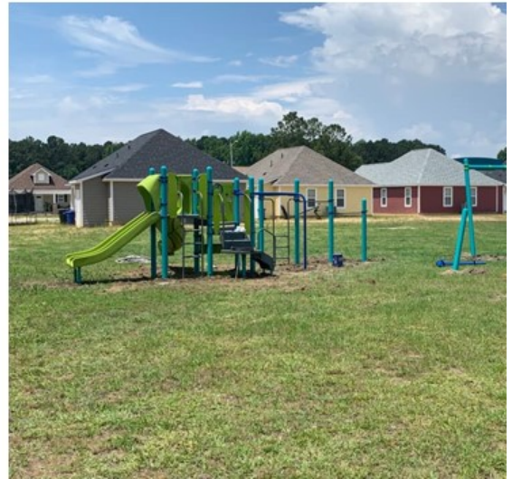
Posted by Jackie Cuthbert July 6, 2021