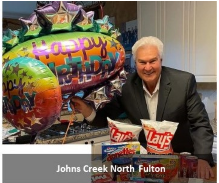
Johns Creek North Fulton