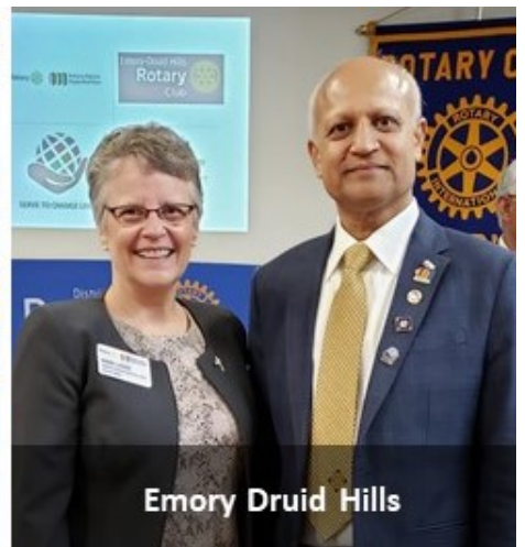
Emory Druid Hills